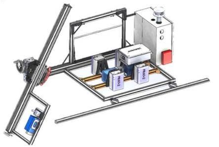
Figure 2. The measurement head with its vertical and side units. Each unit includes LiDARS (in blue), RGB and multispectral cameras operated with flashes. The white box on the right hosts the acquisition system.

The measurement head (Figure 2) is made of two units: one looking vertically, the other looking at a given incidence angle from the side. The two units are positioned to sample approximately the same crop volume. Each unit is equipped with LiDARS, high resolution RGB cameras and multispectral cameras. The cameras are operated in active mode using powerful flashes, making the measurements fully independent from the illumination conditions.