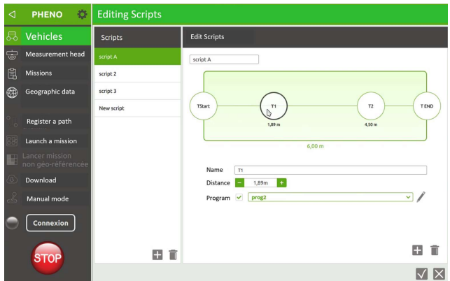
Figure 3. One typical page of the "phenoIHM" interface used to define a script for a given microplot.

The acquisition system is run by a PC using the ROS operating system dedicated to robotics. The acquisition system triggers the measurements that are then recorded in HDF5 format along with all the metainformation required to ensure FAIR principles in data management, including position and time stamp. The system is driven by phenoIHM (Figure 3), the application that defines and runs the mission.